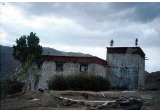
Front and back of Dranang monastery

Dranang is the birthplace of Longchenpa. Rinpoche once gave teachings on Longchen Nyingthig and its history there, and was deeply moved by the faith and devotion of the lay and ordained disciples there. Due to their faith and devotion and other auspicious signs, Rinpoche has promised to rebuild the monastery, work on which has begun since 1997 and is still continuing.