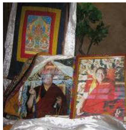
on the shrine altar