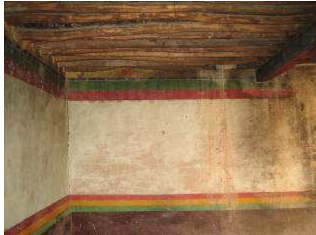
old structures to be rebuilt