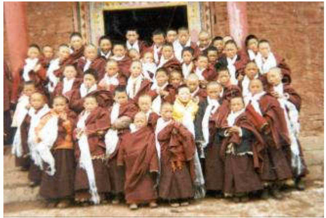
Children in the monastery school