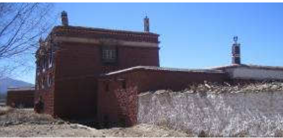
Samye Monastery and Retreat Center