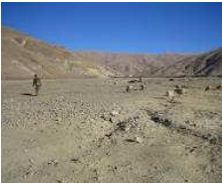
Location near the school site