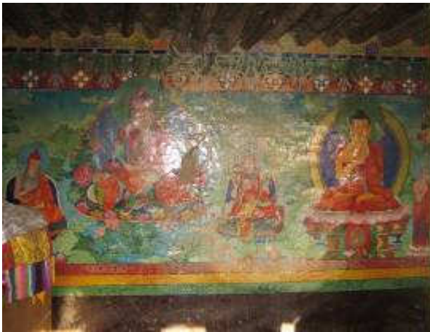
over 1000 year-old ancient frescos